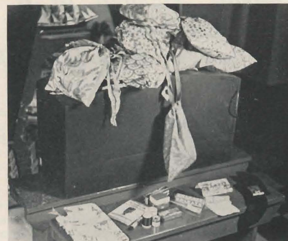
Comfort Bags Being Filled for Christmas

Will readers of THE LOOKOUT send contributions, making checks payable to the Seamen's Church Institute of New York, and mailing to 25 South Street, New York City, marked HOLIDAY FUND.