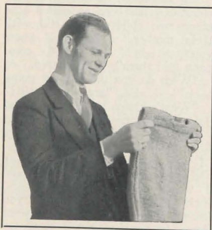
A Sailor Receives a Sweater for a Christmas Gift.