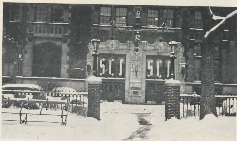
The Friendly Doorway

Wintry Winds Outside; Friendship and Warmth Inside.