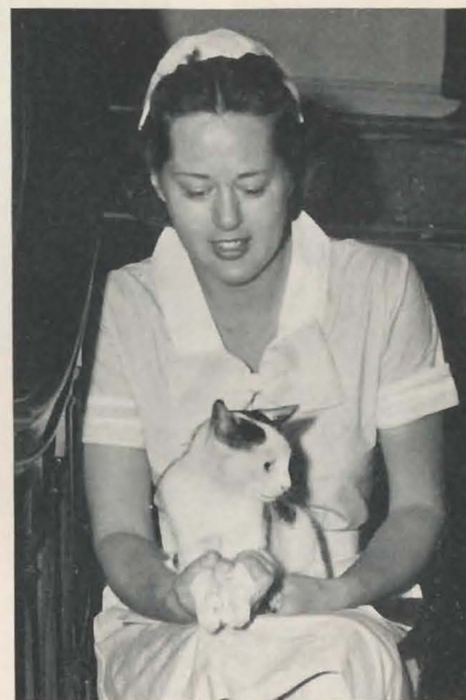
"Coffee Time"