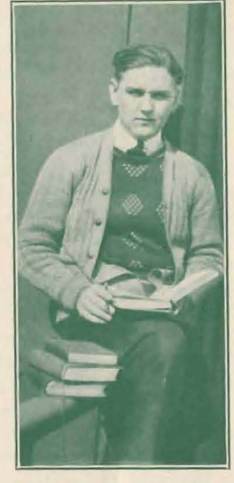
"Reading becomes the balancing factor in a man's life."

Although these lines were meant to apply to the seafaring life of one hundred years ago, there was enough truth remaining in them to give me