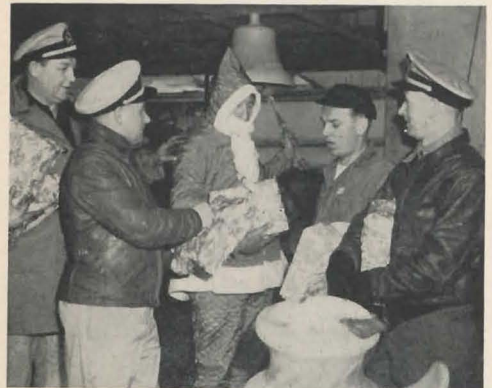
"Santa" from the Seamen's Church Institute visits a ship's crew and distributes holiday boxes.