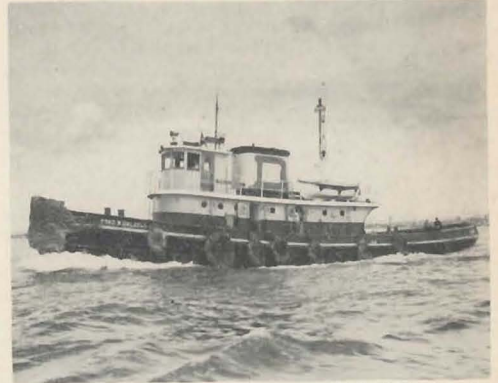
Dalzell Towing Co.

Seven tons of Britain's celebrated Rock of Gibraltar arrived in the United States en route to the Canadian National Exhibition at Toronto. A gift of England to the Prudential Insurance Company of America, the rock segment was unloaded from American Export Lines' freighter Excellency at Pier 39, Coffey Street, Brooklyn. After being shown at the exhibition the rock will be on permanent display at Prudential's Canadian headquarters in Toronto.