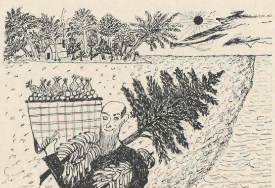
Drawing by H. W. Corning

"Ahem, ahem," exclaimed Uncle Elair, "Blow away my top-sails, shred my lower rigging, burn up my boilers, scuttle me if I didn't forget to mention that he traveled safely over the floating tangle of weeds by using an oversize pair of snow shoes!"