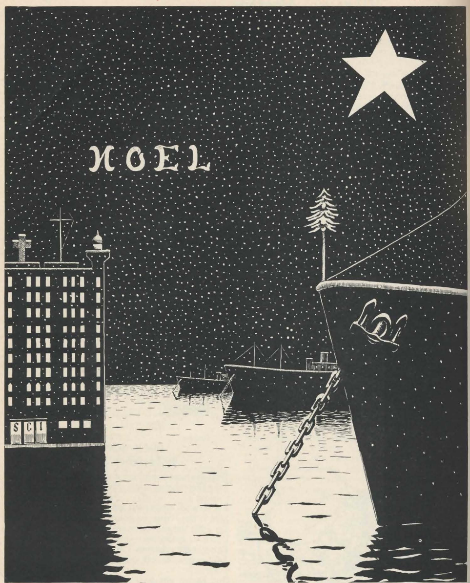
Drawing by Rene Cruz