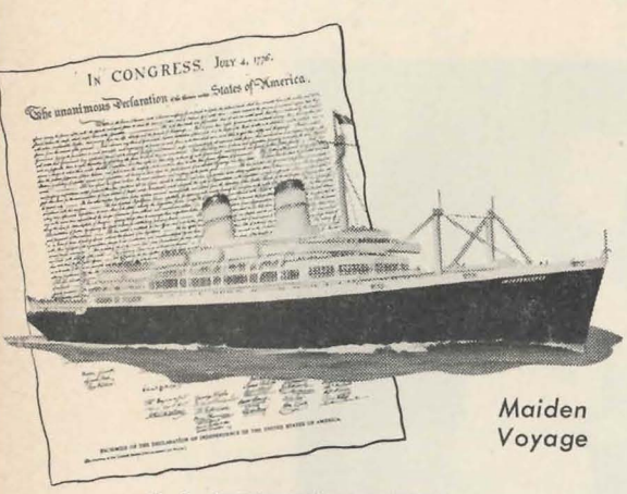
S. S. INDEPENDENCE NEW YORK TO MEDITERRANEAN February 10 to April 4, 1951