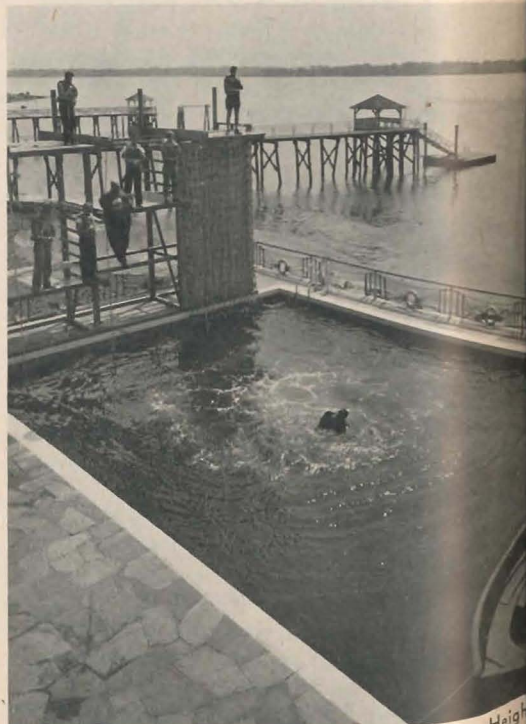
Cadets Practice Jumping into Water from Various Heights