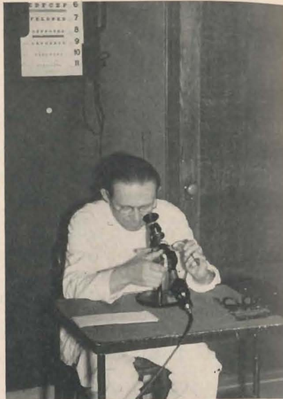
The Lensometer Measures the Lens

treatment and glasses each year, thus restoring their confidence and helping them to get better jobs.