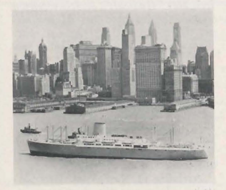
S.S. Panama, New Ship of the Panama Line

The officers and crew were assigned bedrooms on the ninth floor, and after they had had a good night's sleep they were anxious to see the sights of New York. They talked cheerfully of their experience, told of losing all their "gear" and belongings, and one cabin boy told of having purchased twelve pounds