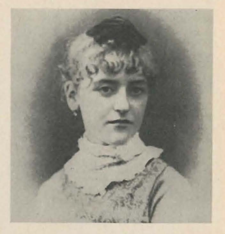
Mrs. Roper When She Was 17 Years Old

Images and/or text cannot be shown due to copyright restrictions.