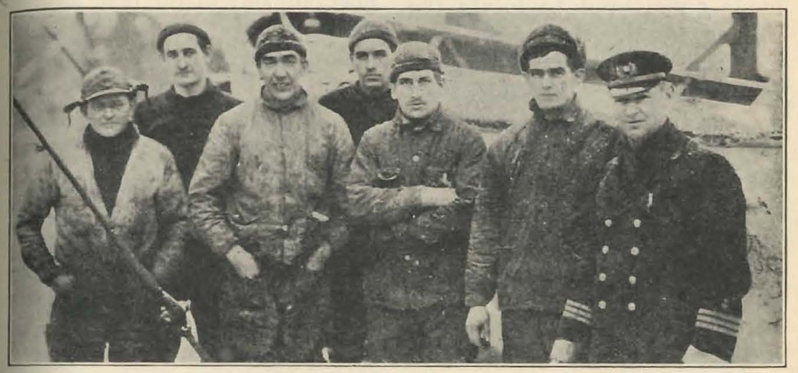
The heroic crew of the "Saguache."

"S O S. Our ship sinking headlines in the dailies. fast."