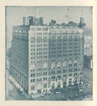
"25 South Street," largest shore home in the world for active merchant seamen of all nationalities.