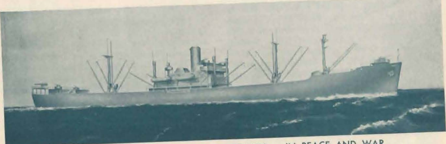
CREWS OF VICTORY SHIPS - ON THE JOB "Victory Ships, C-1-2-3-4 cargo vessels, and tankers carried 80% of the supplies needed for United Nations' Armies in Korea."

It has been serving merchant seamen since 1844.