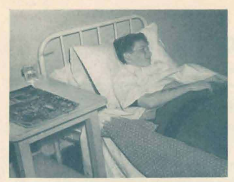
"There is a tremendous spirit of camaraderie among the men in the hospital."

gave me another hypo, and it must have been a strong one, for I sure passed out."