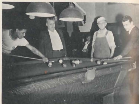
A GAME OF POOL