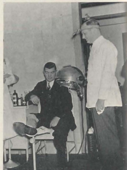
A VISIT TO THE CLINIC