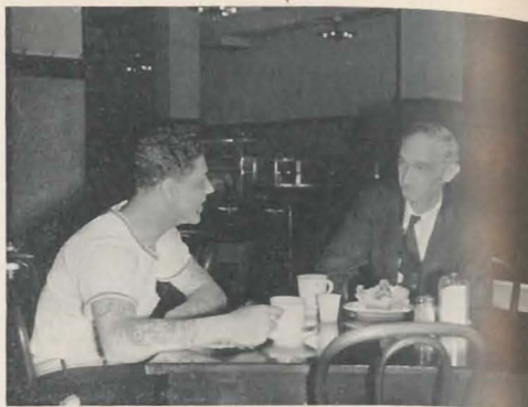
A GOOD MEAL