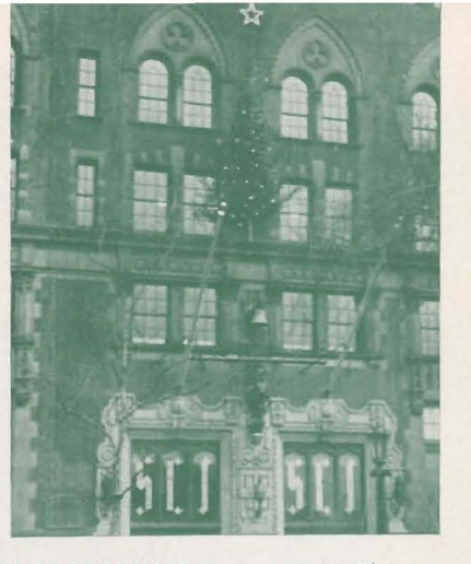
MAIN ENTRANCE Decorated for Christmas.

*Prepared by the Central Council of Associations