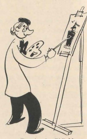
Drawing by Phil May