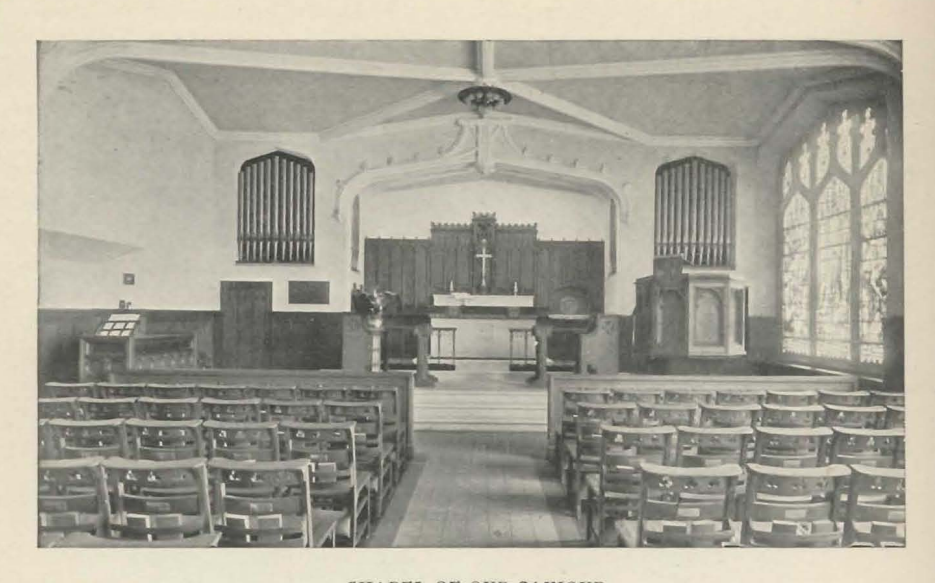
CHAPEL OF OUR SAVIOUR Built by contributions from Parishes in the three Dioceses of New York, Long Island, and Newark, and furnished by subscriptions from many individuals and church organizations.