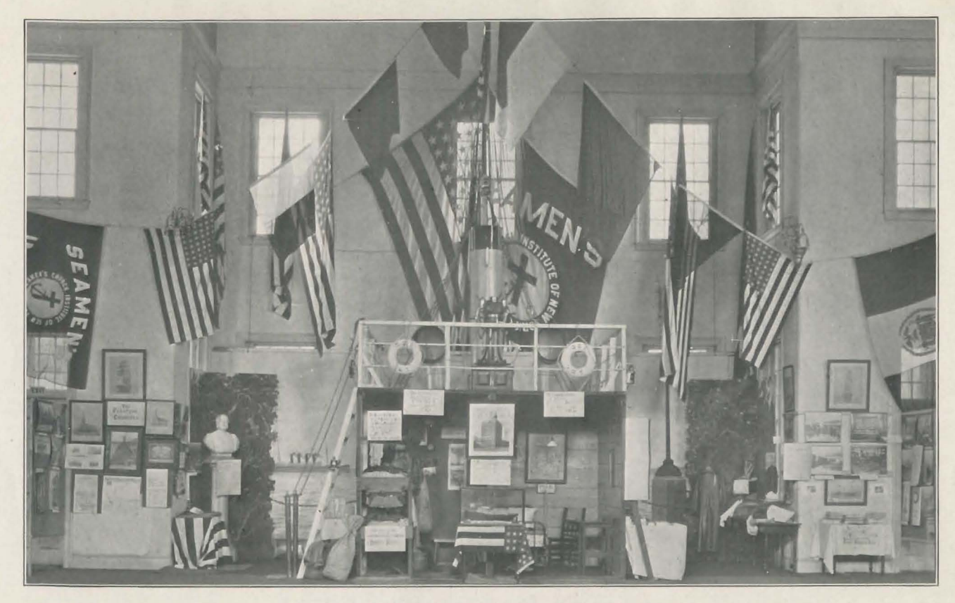
EXHIBIT OF SEAMEN'S INSTITUTE WORK

Glimpses of the seaman's life shown in the Exhibit at Old Synod Hall November 10th, 11th and 12th. See description on Page 11. On the table at the left of the picture are trophies from confiscated dunnage, among them an opium pipe from China, a hookah from India, a Japanese water pipe and a Ceylonese curry pot.