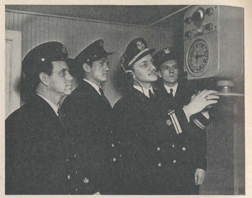
Deck officers at the U.S. Maritime Officers' School, Fort Trumbull, New London, Conn. are instructed in the use of the radio direction finder

men are assigned to a room which is more spacious than the average college dormitory room.