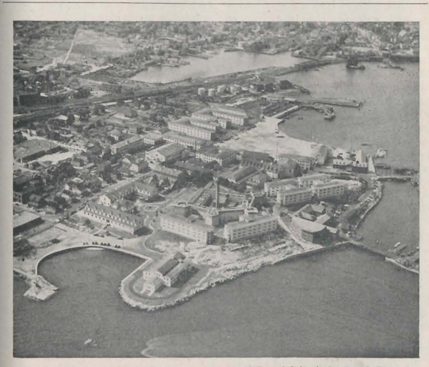
An Air View of the U. S. Maritime Service Officers' School, Ft. Trumbull

Living quarters, which bear the names of famous clipper ships such as Flying Cloud, Typhoon, Dreadnought, Tradewind, Red Jacket,