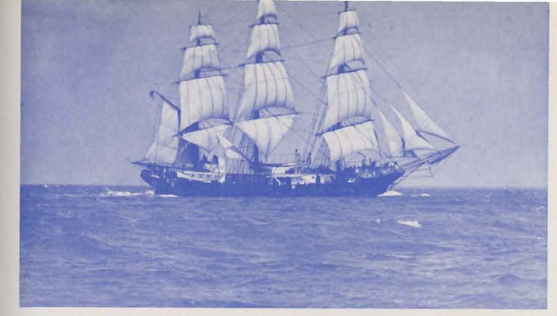
SCHOOL MISTRESS OF THE SEAS: The smallest three-masted square-rigger afloat, the JOSEPH CONRAD, is doing her bit to defeat the enemy by training men for America's Merchant Marine. She makes a dramatic picture as she sails down Tampa Bay from her base at the U.S. Maritime Training Station, St. Petersburg, Florida.

windjammers are serving their country by teaching fledgling seamen the "all-for-one, one-for-all" philosophy essential for a fine esprit de corps on any ship, whether propelled by sail or steam.