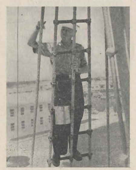
Painting the Ratlines of the U.S.M.S. Tusitala

CQUARE-RIGGED sailing ships -picturesque relics of bygone days-long ago gave up the struggle to compete as cargo carriers with their rivals: the steamships. But they are serving a useful purpose in the war, doing their bit to defeat the Axis, as seagoing classrooms for America's fast growing Merchant Marine. Young men destined for sea careers are following in the footsteps of their Yankee clipper-ship ancestors by learning the fundamental principles of wind ships and in the learning, becoming better fitted for the arduous jobs ahead of them, manning our merchant fleet.