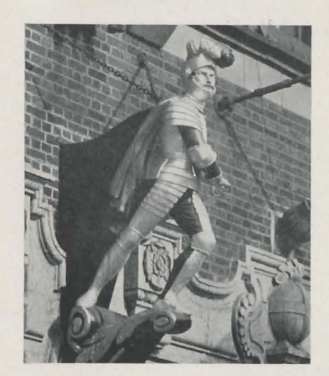
Figurehead of "Sir Galahad" (Until otherwise proved)

Lancelot." "I am afraid that it is not 'Sir Lancelot's'! From a rather rough photographic reproduction of the builder's model reproduced in Brebner's handbook her figurehead lets into the stem about the hipsand this is confirmed by the water colour drawing in my possession, I expect the 'Sir Galahad' came off an old wooden ship, as it was unusual to have full length figureheads later than the 1850's but many of the big Yankee clippers had them, of course, such as 'Silas Crockett', 'Champion of the Seas'.