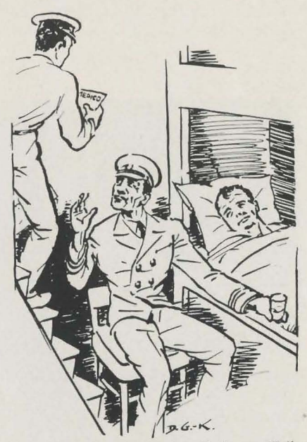
Drawing by Donald Greame Kelley

APPLY WET DRESSING OF SATURATED SOLUTION OF EPSOM SALTS REPORT PATIENTS TEMPERATURE ALSO ARE THERE RED STREAKS RUNNING UP THE