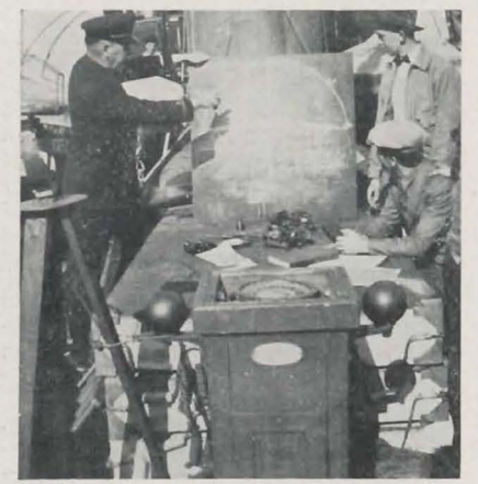
Cadets aboard the North Star receive instruction in the use of the chronometer and sextant.

F anyone should ask you who is the first person to board an incoming ship in New York harbor, you would be right if you said: "The pilot." And if you were asked to name the next important individuals you would doubtless say: "The Customs inspectors, the Immigration inspectors and the doctors." But the chances are you would guess wrong, if someone posed this one: "Who is the first important person to go aboard AFTER the ship has docked at her pier?"