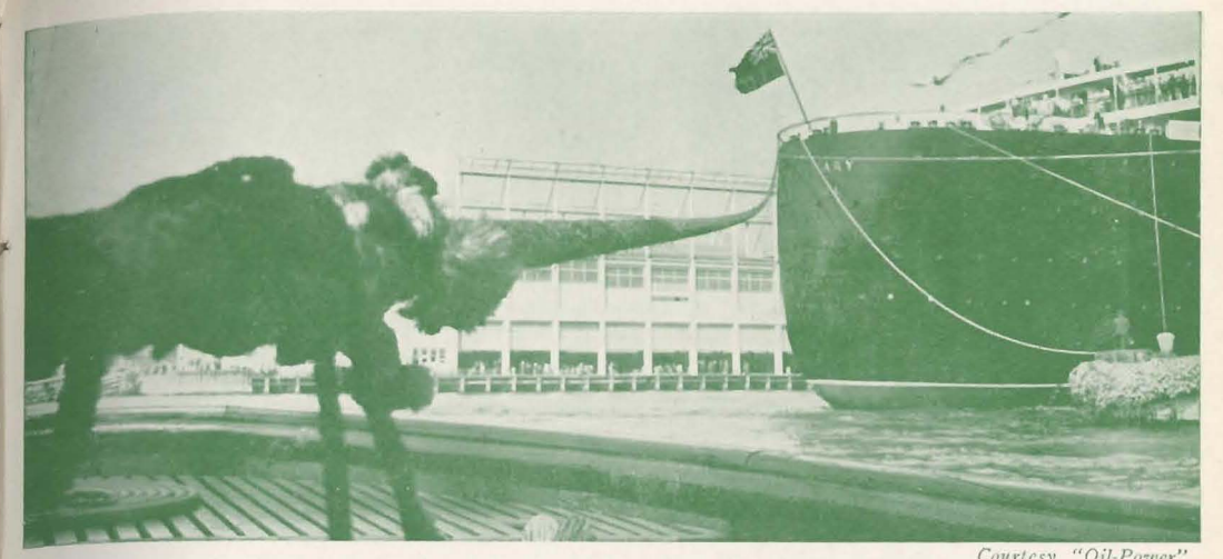
The "Queen Mary" is Held by a Manila Hawser 3 Feet Thick