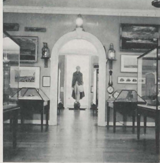
A view of the Museum showing the Figurehead of President Andrew Jackson.

OND parents who find themr selves unable to answer questions of their offspring when they pertain to ships, can easily solve this problem by taking their youngsters on a visit to the Marine Museum. This fascinating place is located in the Museum of the City of New York, at 103rd Street and Fifth Avenue, and it should be compulsory for all New Yorkers to visit it to learn why this is such a great seaport. Here, the curiosity of seaminded vouths and adults may be satisfied. Here, you may wander in and out among the cases of ship models — hundreds of them — and here you may gaze upon paintings of famous ships of yesteryear.