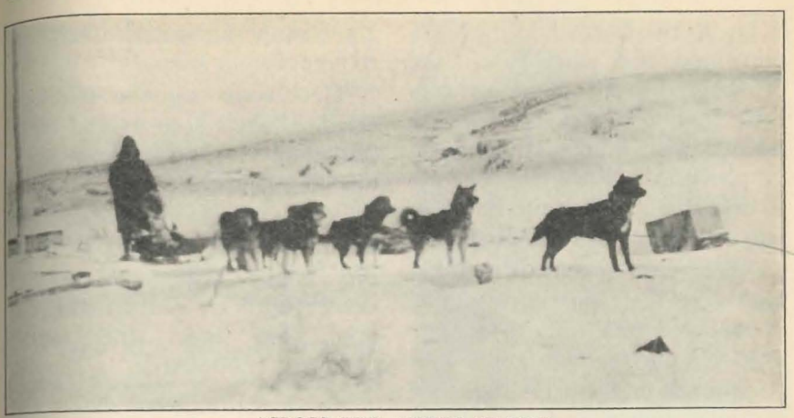
ACROSS THE ARCTIC WASTES

He is forty-nine years old but he does not look a day over twenty-five, so rugged an outdoor life has he led. He has guided expeditions to the North Pole, and has won a prize for climbing Mt. McKinley. When