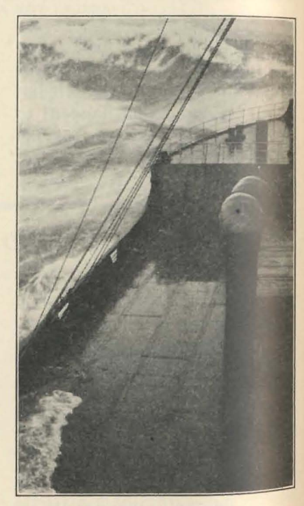
SHE BEGAN TO SINK

"Calm and majestic she seemed to us, plowing through the angry seas—nearer and nearer until we could make out upon her bow, the name, 'August Leonhardt.' South-