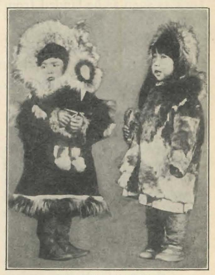
HIS TWO PAPOOSES