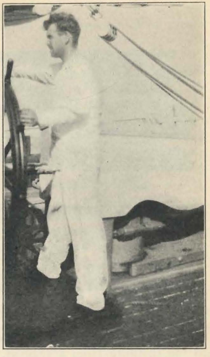
"I GRABBED THE WHEEL"

"Never was there such a wind or sea! The 'August Leonhardt' rocked like a frail canoe. The whole night long and all next day the storm raged and blew us off our course. At last the winds grew tired and the waves died down. Somehow the 'August Leonhardt' had weathered the storm and under her master's guiding hand she found her course again, while we, the crew of the little 'Wellington' groped on her deck,