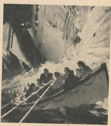
Drawing by Jerome Rozen