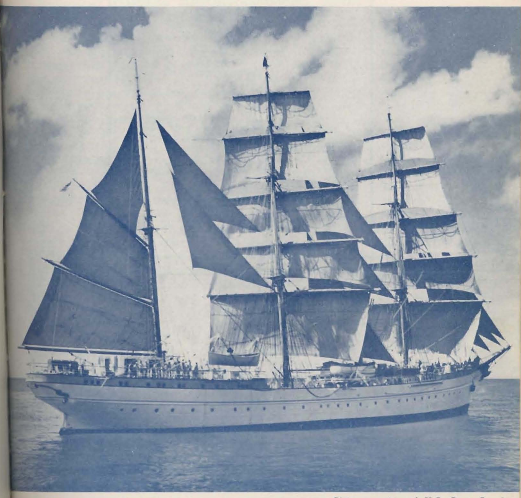
PAINING SHIP: "EAGLE"