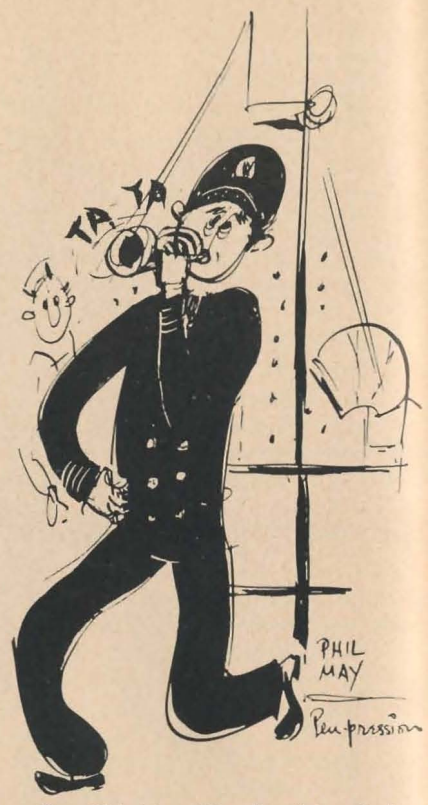
The Old Man Was Practicing Scales

very familiar to our ears. One of the AB's who came from a long line of Army men yelled out, "It's the "Retreat", fellows!"