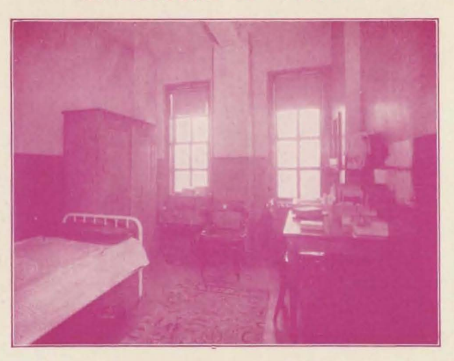
Typical Bedroom for Officers

To perpetuate the memory of a loved one by some worthwhile service—that is the desire of many thoughtful persons. In what more beautiful and practical way can you commemorate those who have gone beyond than by giving a memorial in the Annex Building of the Institute?